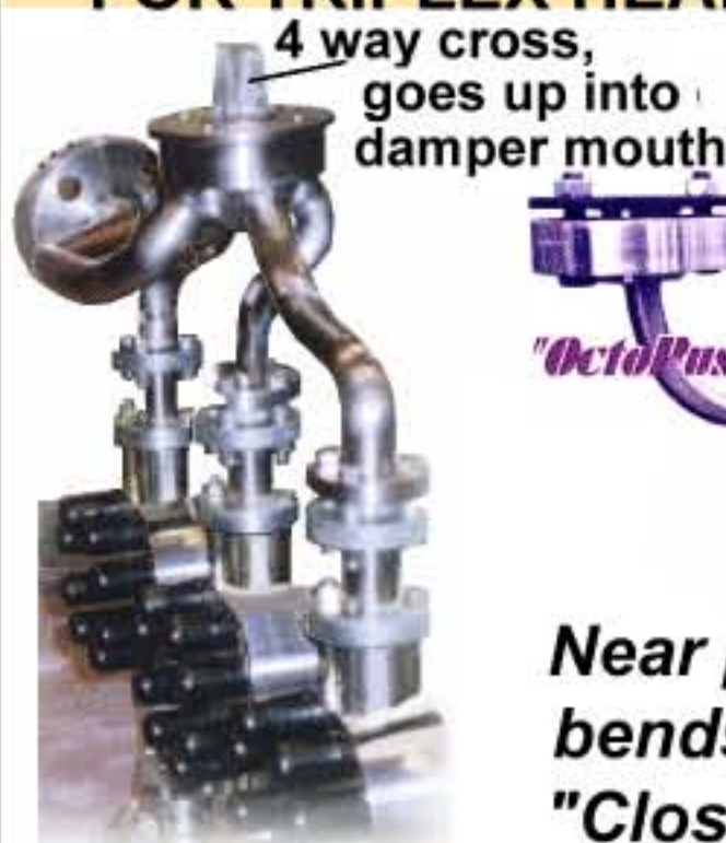
4 way cross, goes up into damper mouth

And for the suction where it is most important.