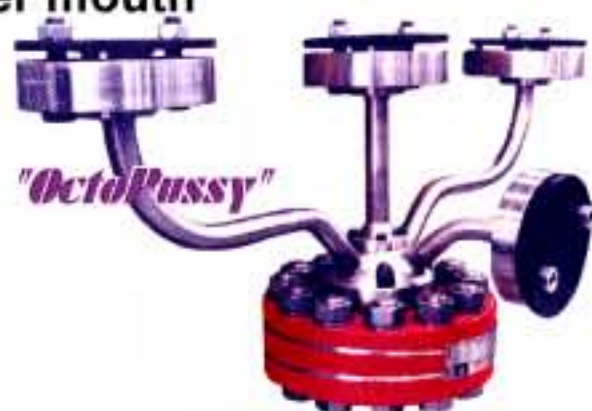
Near perfect; 5 D bends, yet "Close Coupled"