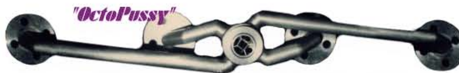
What NOT to do. **