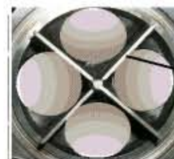
"contour ported" divider added.