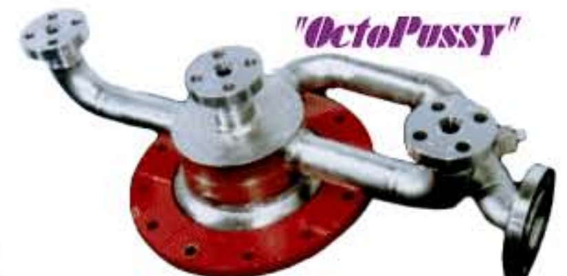
space saver Pump so low, it loses more from tight "Ls" than head gain.